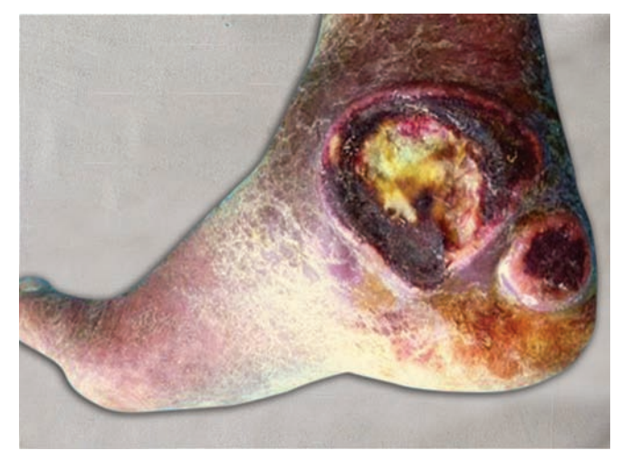
Fig. 5: Diabetic foot with ulcer on the medial side of ankle and foot with induration of surrounding skin and necrotic slough in the base