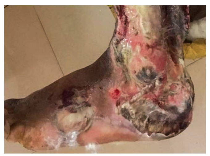
Fig. 6: Diabetic foot with gangrenous patches with slough extending in to the leg and foot required above knee amputation