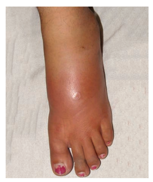
Fig. 3: Diabetic foot with cellulits and swelling on the dorsum of foot which required treatment with prolonged antibiotics