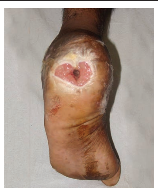
Fig. 4: Diabetic foot with deep ulcer on the heel which required excision and partial calcanectomy