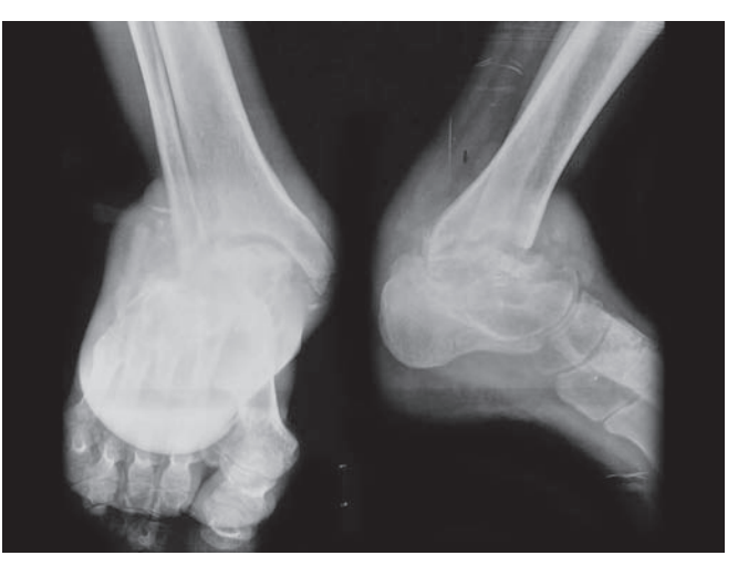
Fig. 8: Charcot neuroarthropathy of the ankle in a diabetic patient

Before the start of an empirical therapy, it is essential to diagnose the colonizing organism by biopsy/pus culture sensitivity testing.<sup>11,12</sup>