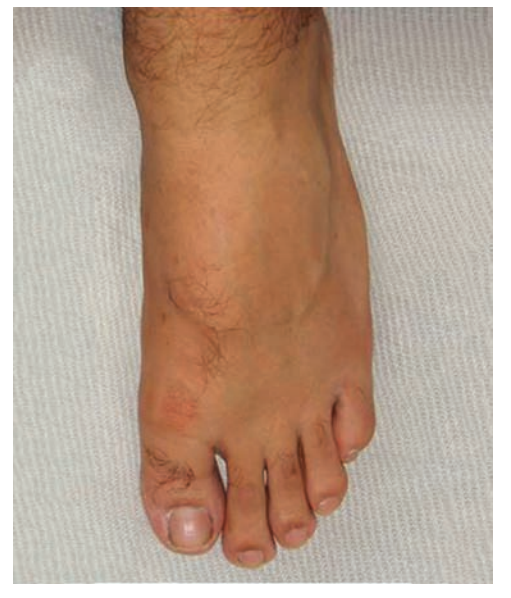
Fig. 1: Normal foot with shining pink nails and normal skin texture