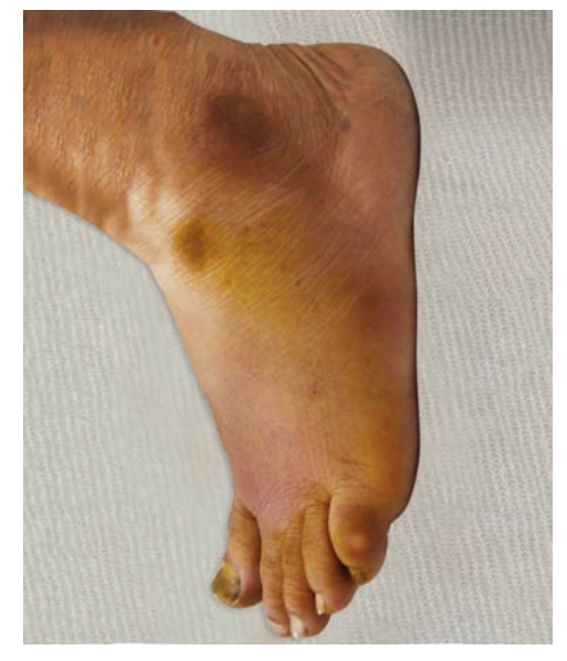
Fig. 2: Diabetic foot with brittle nails and a focus of redness just proximal to toe-bases which was well prevented with antibiotics and control of blood sugar levels