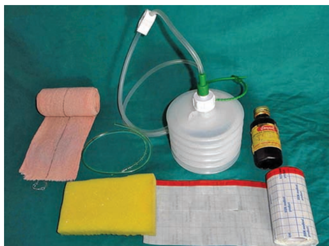
Fig. 3: Saraiya and Shah 46 utilized available medical supplies to recreate NPWT in areas of low resource and socioeconomic status

Negative pressure wound therapy may also be used as a strategy to decrease or protect an open wound from infection. Animal studies have found a decreased incidence of