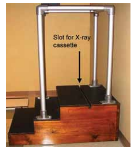
Fig. 1: Stand for weightbearing X-rays with a slot for X-ray cassette

Footlab should have equipment like biothesiometer (Fig. 3), hand held vascular Doppler (Fig. 4) and Harris met (Fig. 5). These are essential for diagnosis of neuropathy,