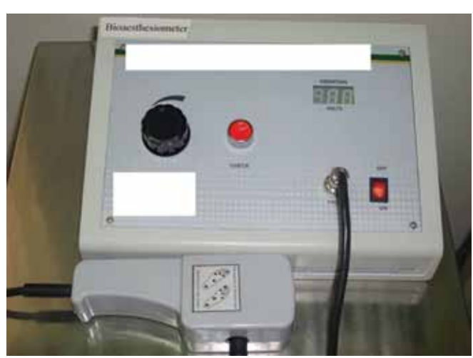
Fig. 3: Biothesiometer to detect neuropathy

Over and above patient care activities, such foot and ankle centers in underdeveloped countries need to work