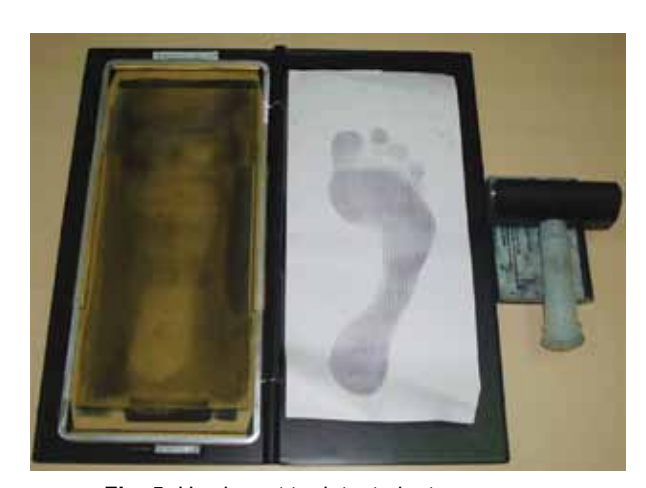
Fig. 5: Harris met to detect plantar pressure