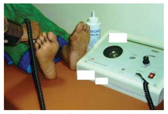
Fig. 4: Vascular Doppler to detect vascularity

assessment of vascular status and assessment of plantar pressures respectively.