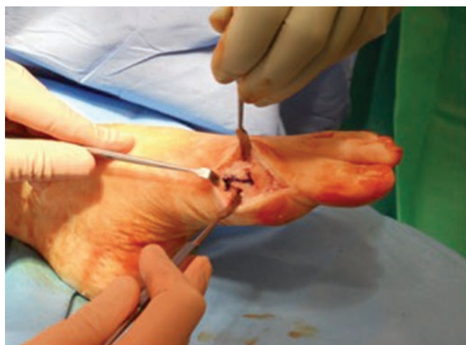
Fig. 2: “Z”-shaped step cut is marked