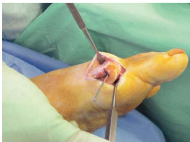
Fig. 3: A transverse hole with a K-wire is made at the apex of the distal cut to avoid a stress riser before the osteotomy