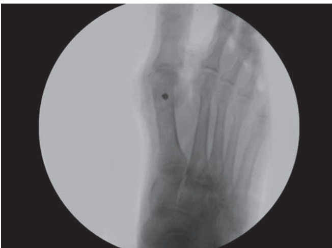
Fig. 6: Intraoperative simulated weight-bearing X-ray to confirm satisfactory correction and tibial sesamoid position