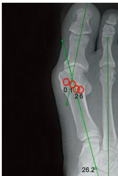
Fig. 1: Tibial sesamoid position grading: Grades 0 to 3

also assessed by using a global satisfaction questionnaire asking about overall satisfaction of the procedure, symptom relief, and if they would recommend the surgery to a friend. Nonparametric Mann–Whitney U test was used to check the statistical significance of our results.