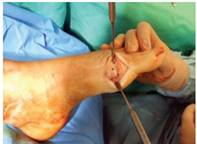
Fig. 7: Osteotomy is secured by a single differential pitch 3.00 mm cannulated headless compression screw

in the gap created in the proximal plantar osteotomy. A medial capsulorrhaphy is then performed with a No. 2 vicryl suture, ensuring relocation of the sesamoids in their respective sulcus. The wounds are then closed in layers with absorbable sutures and a compression dressing applied. A postoperative shoe with a posterior heel raise is used for partial weight bearing for 3 weeks. The dressings are changed at 3 weeks and full weight bearing permitted at this stage. At 3 weeks, weight-bearing dorso-plantar and lateral radiographs are performed and a referral to physiotherapy made. Further follow-up takes place at 3 and 6 months. For the purpose of this study, a minimum further follow-up at 12 months was also made (12–28 months) with radiographs and AOFAS scoring at final follow-up.