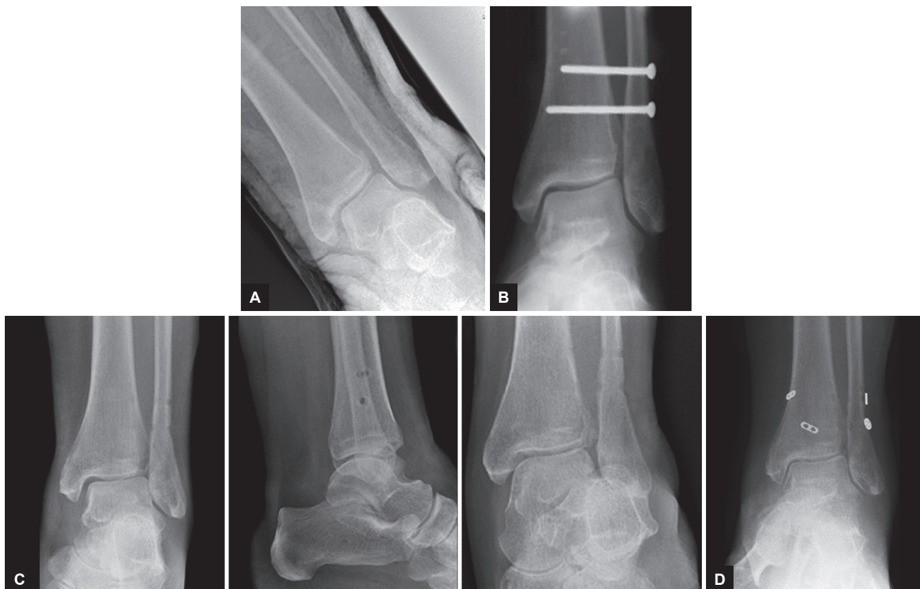
Figs 3A to D: (A) Preoperative radiograph of ankle showing syndesmosic injury; (B) syndesmosis fixation with two screws; (C) stress external rotation view after removal of the screws; and (D) six months post revision syndesmosic fixation

advantage of suture button construct when compared with screw fixation system is the ability to resist diastasis and also to maintain physiological movement of the fibula in relation to the tibia when the ankle is subjected to external rotation or axial loading. 17