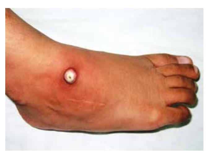
Fig. 1: Clinical photograph showing an inflamed sinus over the dorsum of the foot at the site of tendon transfer

Tibialis anterior tendon transfer is commonly employed for correcting dynamic supination deformity of feet following Ponseti cast correction of club foot. There are many techniques described for this procedure. Essentially, the insertion of the tendon is transferred from the inferomedial aspect of base of first metatarsal and medial