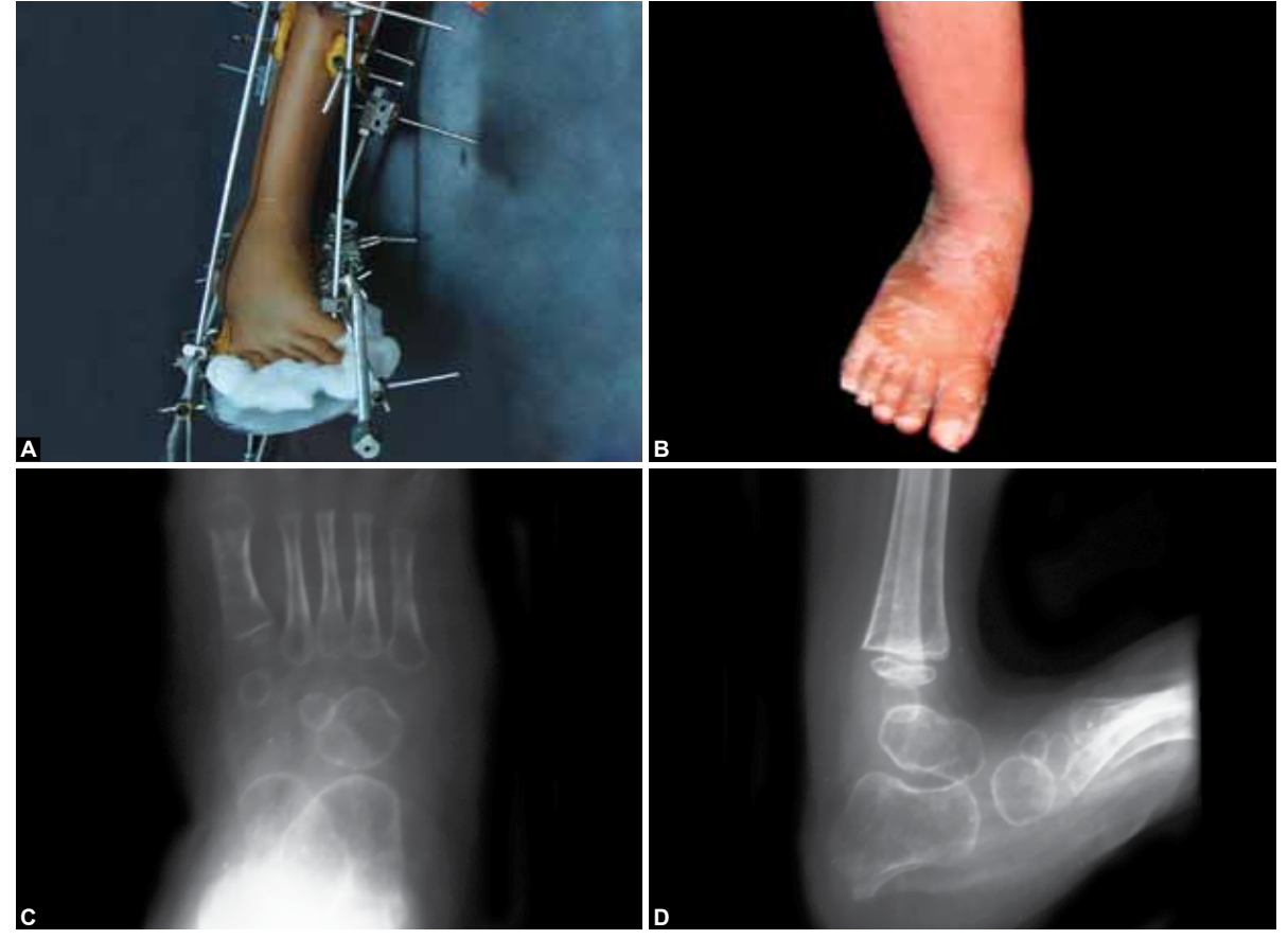
Figs 2A to D: (A) Fixator in position after 3 weeks of distraction, (B) postoperative photograph showing correction of deformity after removal of JESS, (C) after removal of fixator—AP view and (D) after removal of fixator—lateral view

In the present study, radiological evaluation of feet was done by measuring angles (talocalcaneal angle AP and lateral view, talocalcaneal index, talo 1st metatarsal angle) (Table 1). Although subjective evaluation of results was done on the basis of correction of deformity, gain in stability, gain in gait and locomotion but so as to access the accuracy of correction achieve the detailed radiological analysis was done. Roentgenographic evaluation