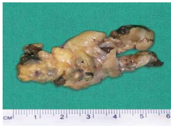
Fig. 2: Blackish mass partly adherent to skin

Surgical excision of the accessible lesion in combination of antifungal therapy is the effective treatment of choice for subcutaneous alternarial infections. 7 The antimycotic drugs used are amphotericin B, itraconazole. 1,5,7,12,14 Marilia Marufuji Ogawa et al 2009 presented a case series of prospective follow-up of 17 kidney transplant patient treated for subcutaneous phaeohyphomycosis and they found poor response or hepatotoxicity to itraconazole in severe disease cases. 7 Voriconazole,