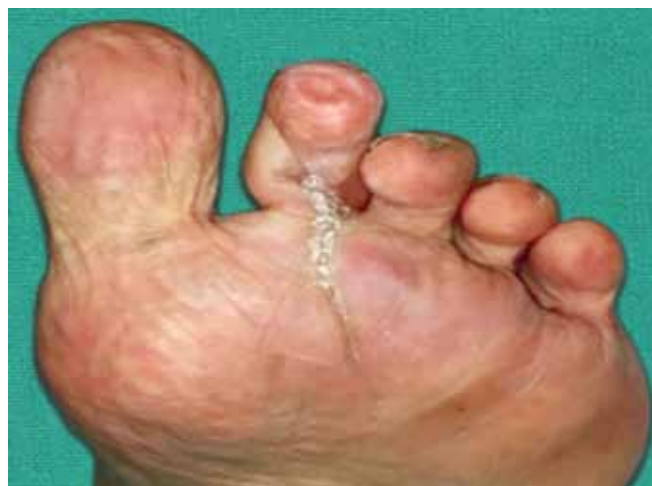
Fig. 4: Healed wound at 2 months of treatment