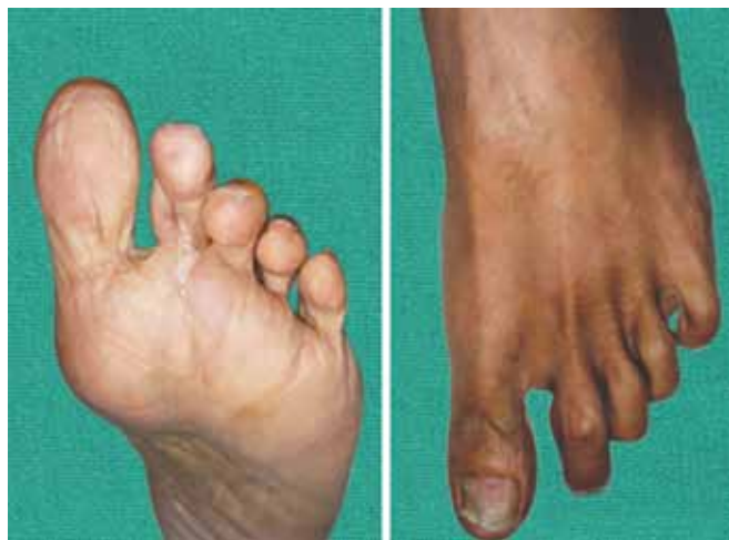
Fig. 5: After completion of 6 months of treatment

derivative of fluconazole, with broad spectrum of activity is a novel alternative to itraconazole in treatment of Alternaria infection. 2,9,15 Marilia Marufuji Ogawa, MD et al recommend antifungal therapy for duration of 6 months for effective treatment. 7 RC Boyce et al 6 mentioned about the duration of antifungal treatment should be individualized with ranging from 3 to 4 months to 1 year. In our case, duration of treatment was 6 months with complete remission. The final impact of phaeohyphomycosis due to alternarial infection on renal allograft is minimal. 7