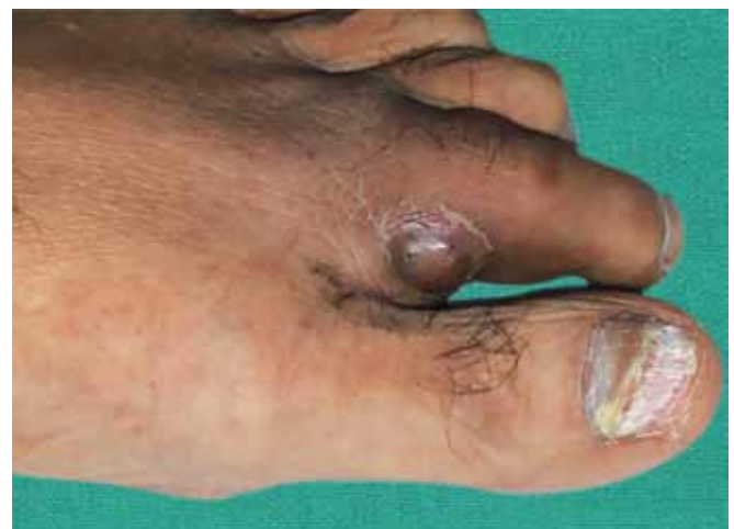
Fig. 1: Clinical image of left foot

A 53-year-old male presented with complaints of recurrent swelling and mild pain over the base of second toe of left foot since 1 year. There was no history recurrent fever, injury, thorn prick, discharging sinus over the left foot. Patient has undergone renal transplantation 4 years ago and was on immunosuppressive drugs like deflazocort 6 mg twice a day, mycophenolate mofetil 500 mg twice a day. Excision biopsy of the foot swelling was done elsewhere ten months ago and histopathological diagnosis made was Actinomycosis with no growth on culture. He took tablet doxycycline for 3 months, but the swelling had recurred in matter of 2 months. The swelling at presentation was solitary, mildly tender, soft to firm, irregular shaped, partly adherent to overlying skin with no signs of inflammation (Fig. 1). After laboratory and radiological investigations, we planned for excision biopsy. Under spinal anesthesia, tourniquet was applied. Lazy S shaped incision was taken over plantar surface of swelling extending into first web space. Blackish, soft, irregular shaped mass partly adherent to skin extending into dorsal surface through 1st web space was excised (Fig. 2). Incision could not be completely closed because of the skin excision, hence partly left open after