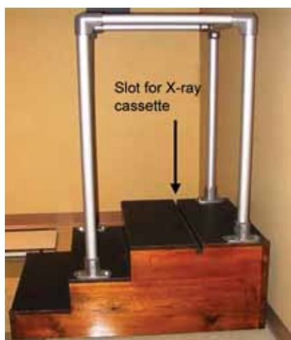
Fig. 1: Stand for weightbearing X-rays with a slot for X-ray cassette

Footlab should have equipment like biothesiometer (Fig. 3), hand held vascular Doppler (Fig. 4) and Harris met (Fig. 5). These are essential for diagnosis of neuropathy,