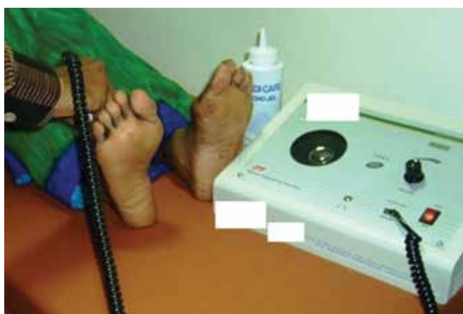
Fig. 4: Vascular Doppler to detect vascularity