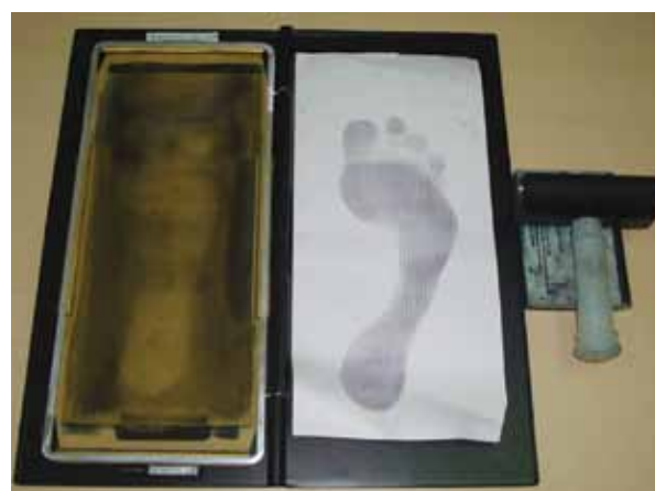
Fig. 5: Harris met to detect plantar pressure