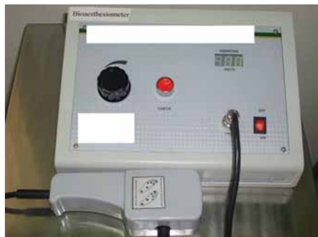
Fig. 3: Biothesiometer to detect neuropathy

Over and above patient care activities, such foot and ankle centers in underdeveloped countries need to work