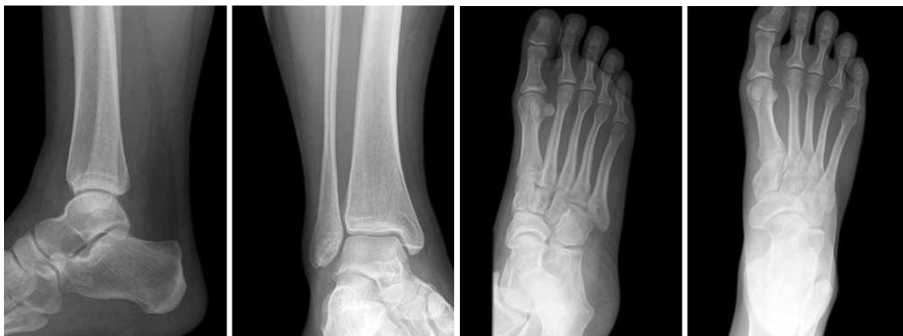
Fig. 1: Preoperative plain radiographs of patient's right foot and ankle showing some irregularity of the talar head

marked marrow edema in the anterior half of the talus with an osteochondral lesion of the talar head (Fig. 2). She was treated with arthroscopic debridement and bone marrow stimulation of the lesion after failed nonoperative treatment. She was mobilized toe-touch weight-bearing for the first 4 weeks, followed by building up to full weight bearing in an aircast boot for another 2 weeks. At 6 week postoperative follow-up, the patient had portal scar sensitivity and an abnormal sensation in the deep peroneal nerve distribution. This subsequently resolved spontaneously. At 6 months follow-up, she had complete resolution of symptoms and the repeat radiographs were normal.