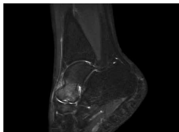
Fig. 2: Preoperative sagittal T2-weighted image of the right ankle with osteochondral lesion of talar head

The treatment of osteochondral lesions can be conservative or surgical. Conservative treatment includes restricted