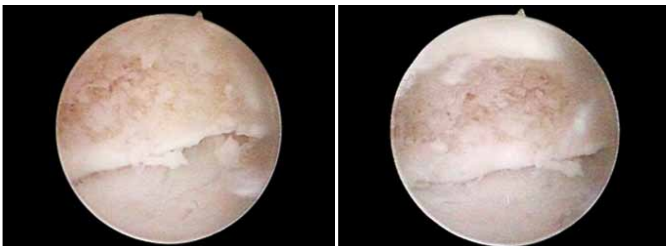
Fig. 5: Postdebridement intraoperative arthroscopy images of an osteochondral lesion of the talar head

activity, immobilization or physiotherapy and may initially be attempted in low-grade lesions. 7 There is no firm evidence that nonweight-bearing cast immobilization offers improved results over weight bearing casts. However, studies have shown that a trial of conservative treatment has no adverse effect on subsequent surgical intervention. 8