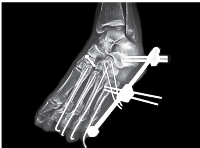
Fig. 1: Postoperative radiograph of a nutcracker cuboid fracture associated with a complex midfoot-forefoot injury. The lateral column length was restored by JESS fixator, K-wires were used to stabilize the metatarsal fracture and metatarsophalangeal dislocations and a lag screw was used to fix the middle cuneiform

midfoot-forefoot injury, in three (25%) cases there was an associated calcaneus fracture and, in three (25%) cases, there was an associated Lisfranc injury. The lateral column injury was addressed by ligamentotaxis and stabilization with JESS fixator (Fig. 1) in eight cases and K wires in four cases. The medial column injury was addressed by JESS fixator plus K wires in two cases and K wires alone in 10 cases. Unsatisfactory reduction of the medial column (Fig. 2) was noted in four cases. Complications were noted in four cases. Wound infection occurred in three cases, of which two cases were superficial and managed by antiseptic dressings alone; one case has deep infection which necessitated debridement and intravenous antibiotics. Nonunion of the 1st and 2nd metatarsal along with reflex sympathetic dystrophy occurred in one case, for which the patient was referred to the pain clinic and is under follow-up. The average AOFAS mid-foot score at final follow-up was 76.7 (61-84). Following Kitaoka et al, four cases were graded as 'good', 7 as